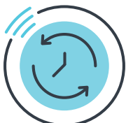
Cleaning cycle time selector