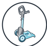
Caddy for storage and handling