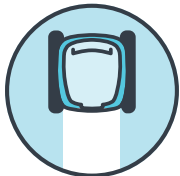
Dual active scrubber