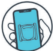
Set & forget, control your robot from anywhere