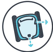
PowerStream mobility system